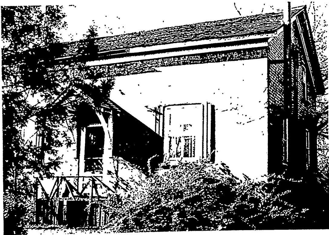
The Adam Clendenen House 9516 Ninth Line (also known as 9642 9 th Line)