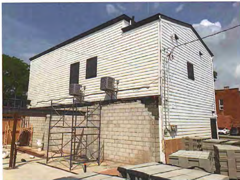
West façade and south facade of the Thomas Drug Store (August 27, 2021)