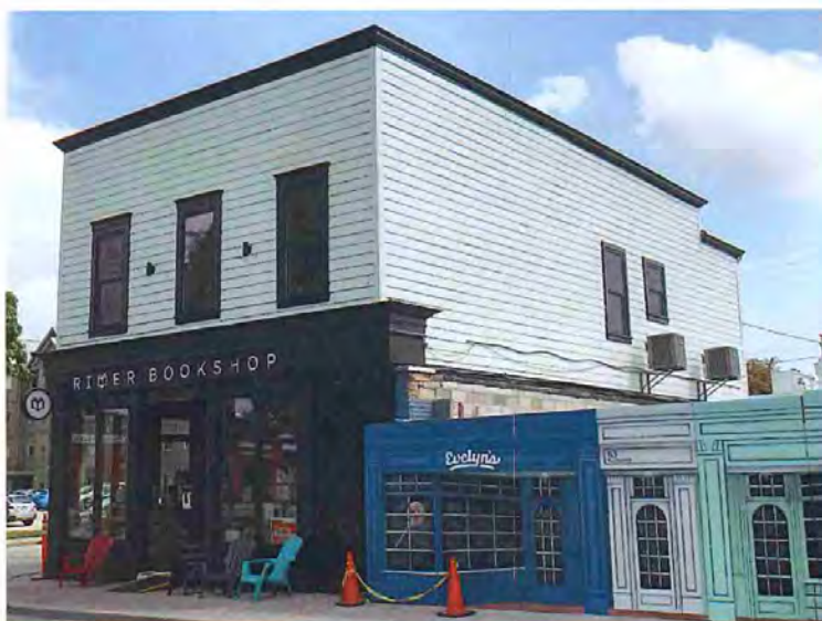
West façade and main facades of the Thomas Drug Store (August 27, 2021)