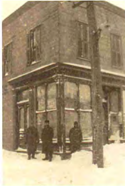
Historic view from the northeast of the Thomas Drug Store, c.1900