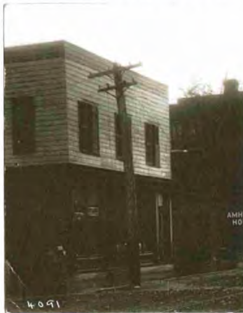
Historic view from the northeast of the Thomas Drug Store, c.1910