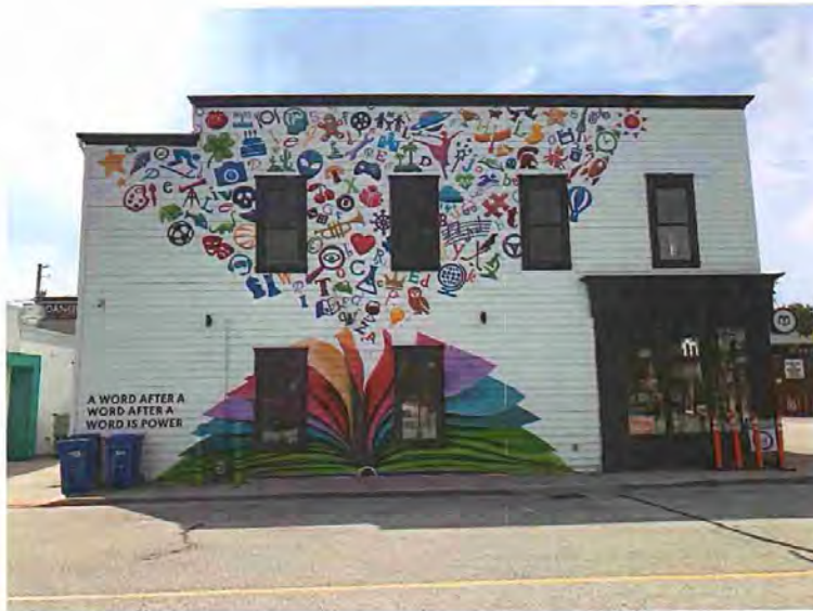
East façade of the Thomas Drug Store (August 27, 2021)