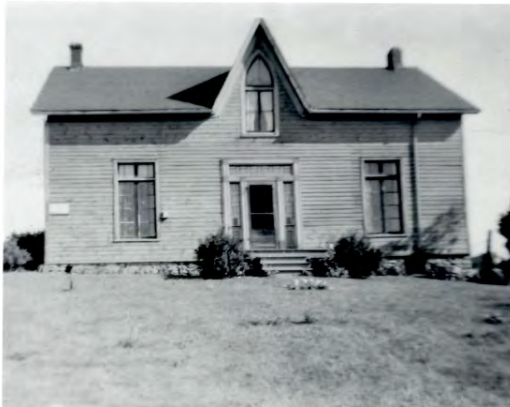
Christ Church Parsonage in original location (Archival photographs in collection of [REDACTED] [REDACTED] dates unknown)