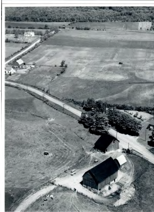
Aerial view: Subject property in foreground (with barn), Parsonage in original location, Cemetery and Church in background