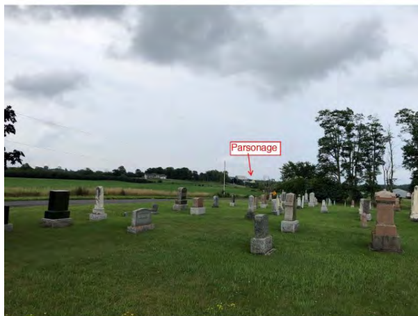
View from Christ Church Cemetery to the Parsonage in its new location (and vice versa) maintains a visual connection