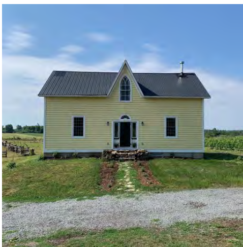
Parsonage in its new location