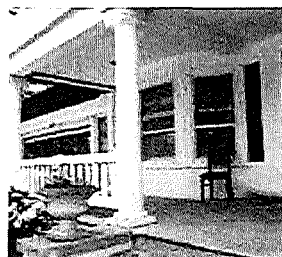
8. Full width porch on front (north) elevation with concrete planters and classically inspired columns.