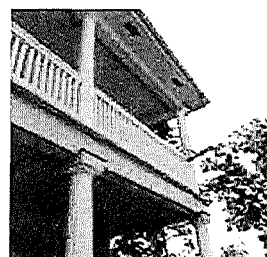
4. Full width balcony on front (north) elevation with classically inspired columns.