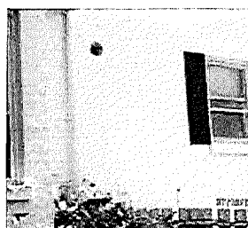
3. Brick exterior