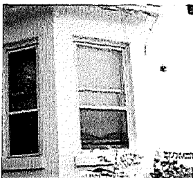
5. One-over-one windows with wood surrounds and wood sills.