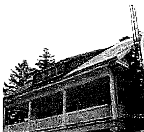
2. Steeply pitched side gable roof with slate cladding, shed roof dormer, two brick chimneys, and concrete chimney.