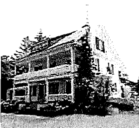
1. Two-and-one-half storey structure with square plan.