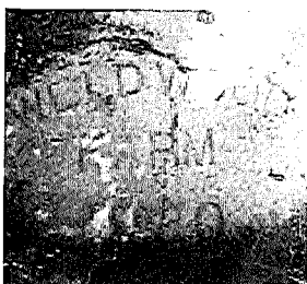
9. Concrete walkway leading to residence from driveway with "Weldwood Farm 1920" stamped in concrete.

Note: Not every heritage attribute indicated above; image is considered indicative of heritage attributes