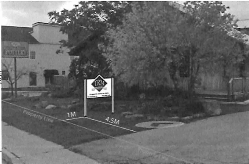
The approved sign, and sign location.