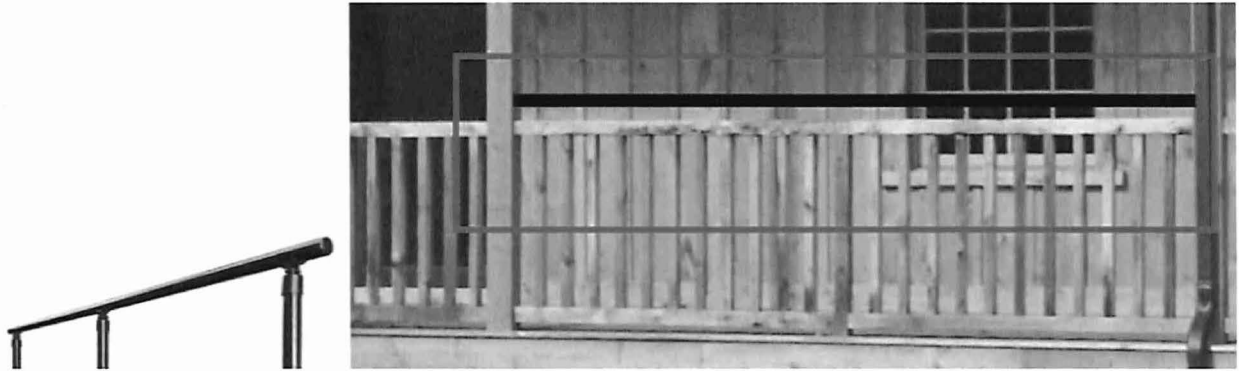
The approved railing material to increase the existing railing heights.