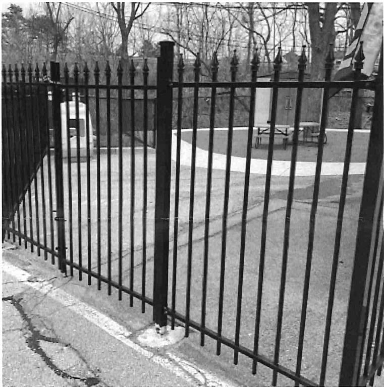
The approved metal fence

The red line in the image above shows the approved location of the black metal fence that will create the enclosed play area for the future school use. The fence will front onto the intersection of Carnegie Lane and Ontario Street.