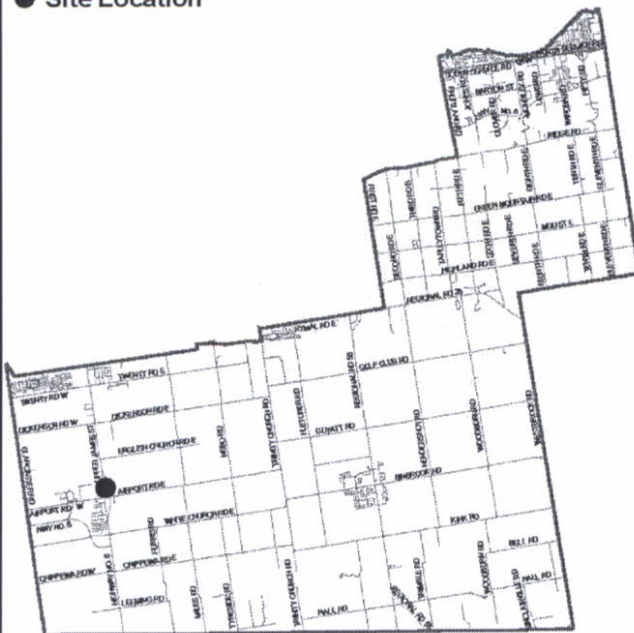
Key Map - Ward 11