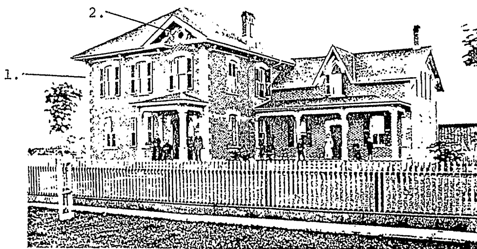
JOHN B. SNYDER HOUSE