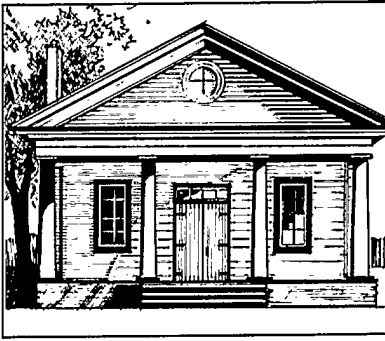
The Town Hall