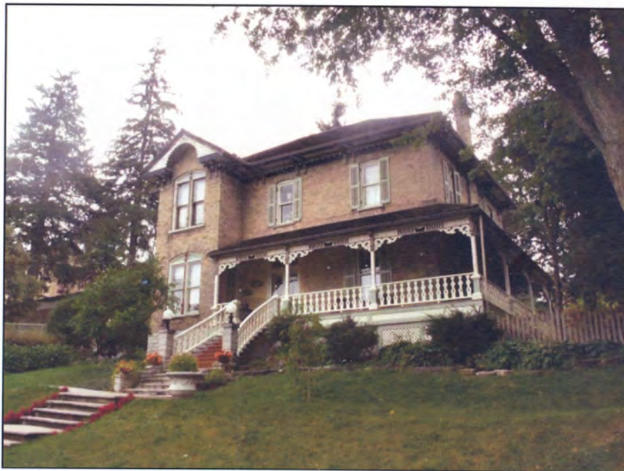
137 Water Street North, September 2013.

E/S Water Street North with & subject to ROW