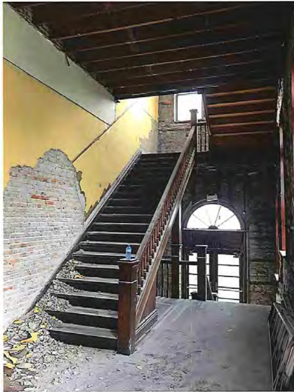
An example of one of the two staircases of 247 Brock Street (August 9, 2021)