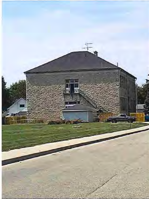
East facades of 247 Brock Street (August 9, 2021)