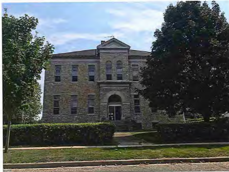
West (Main) façade of 247 Brock Street (August 9, 2021)