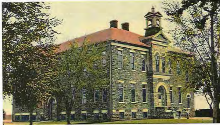
Historic view of West (main) and North Facades, no date, Marsh Collection Society PC100.14