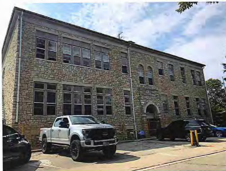
North façade of 247 Brock Street (August 9, 2021)